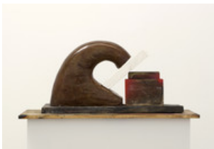
"Overlapping Figures" a bronze, plaster and wood sculpture by Camille Henrot, a young French artist who won a Silver Lion award at the 2013 Venice Biennale. The

The 304 international exhibitors at the 44th edition of Art Basel will have raised expectations, following the $1.1 billion of sales at contemporary auctions in New York last month.